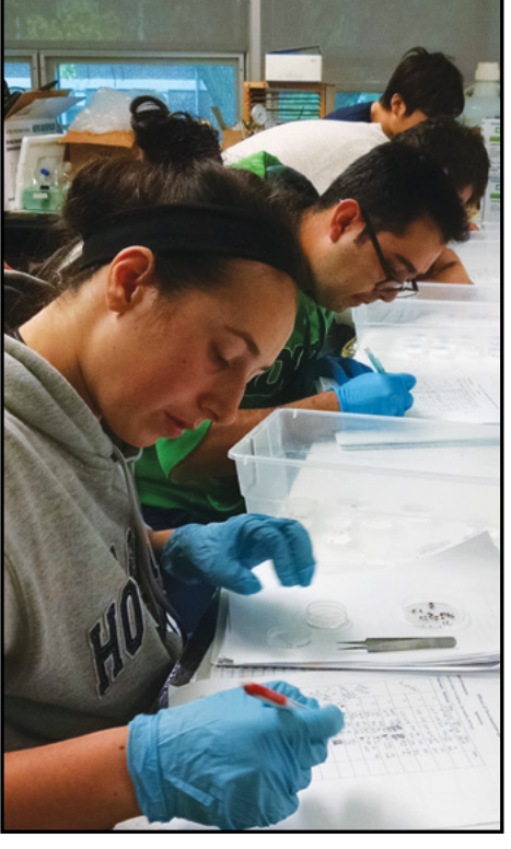
Classroom instruction and experiments.