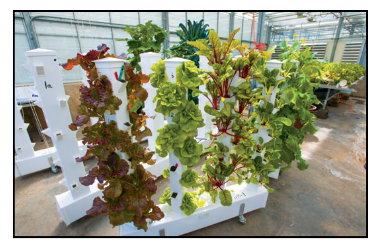
Vegetables growing in aeroponic vertical gardens.