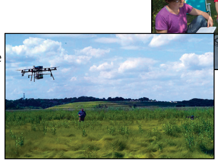
Drone, applying liquid larvicide to control mosquitoes.