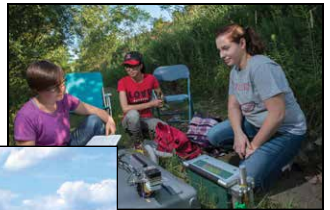
Summer research at Liberty State Park.