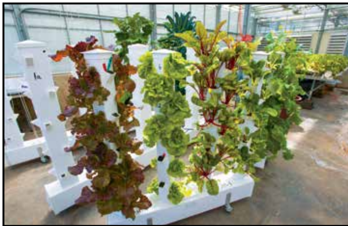
Vegetables growing in aeroponic vertical gardens.

For information on CASE and links to majors and other information about SEBS and Rutgers, visit our website at sebs.rutgers.edu/academics/case.html .