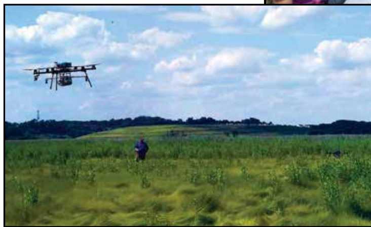
Drone, applying liquid larvicide to control mosquitoes.