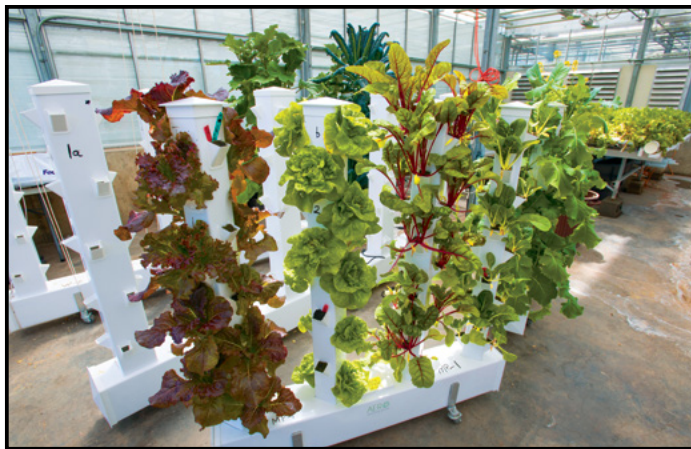
Vegetables growing in aeroponic vertical gardens.

For information on CASE and links to majors and other information about SEBS and Rutgers, visit our website at sebs.rutgers.edu/academics/case.html .