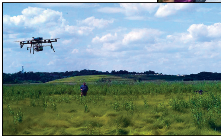
Drone, applying liquid larvicide to control mosquitoes.