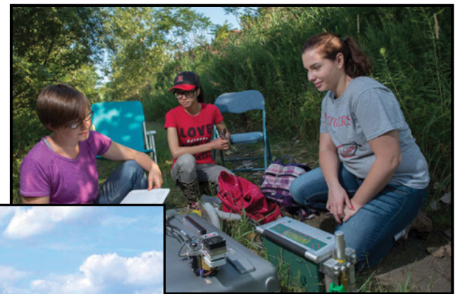
Summer research at Liberty State Park.