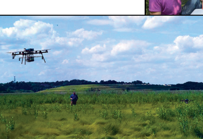
Drone, applying liquid larvicide to control mosquitoes.