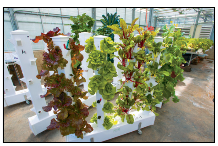
Vegetables growing in aeroponic vertical gardens.

Sciences offers undergraduate professional and preprofessional programs that focus on the entire biological spectrum–from molecules to ecosystems–with