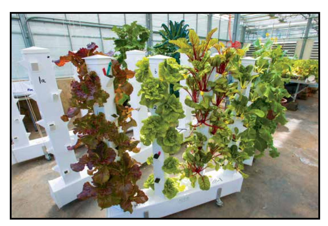
Vegetables growing in aeroponic vertical gardens.