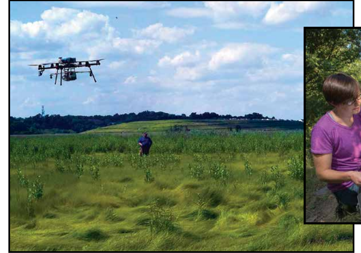
Drone, applying liquid larvicide to control mosquitoes.