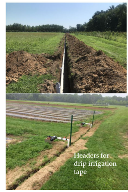
Headers for drip irrigation tape

Over 5,500 feet of irrigation pipe installed in July & August 2020 by Farm Staff; Irrigation system mapped with GPS coordinates