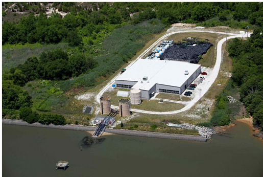
Rutgers Aquaculture Innovation Center, Cape May